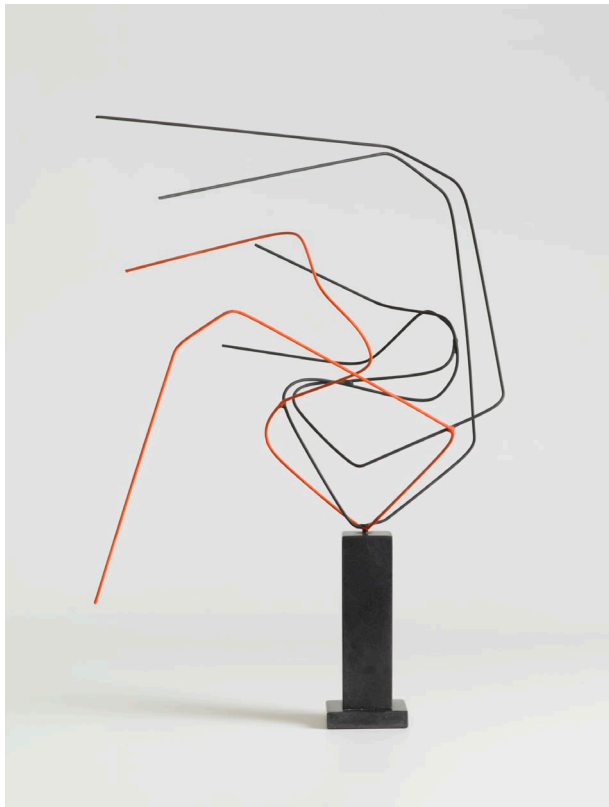
Norbert Kricke, Raumplastik Schwarz-Rot , 1955, Steel, painted