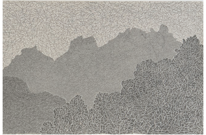
From Balcony, Bex, Curtain of Clouds, 2015-16, graphite on paper (detail)