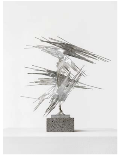
„Raumplastik“, 1959, steel nickel plated, 21 x 26 x 18 cm